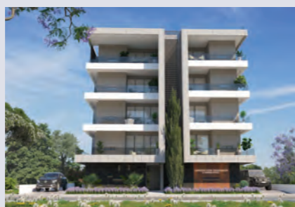
KAMARES HORIZON RESIDENCES 21 Driadon Str., 6041 Larnaca