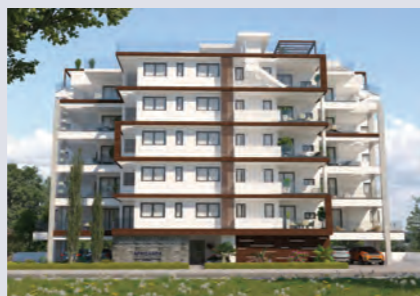
MARINA PANORAMA RESIDENCES 1 Evagora Pallikarides Str., 7060, Larnaka