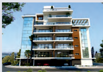
MACKENZY BEACH RESIDENCES 10 Gkaite Str., 6028, Larnaca