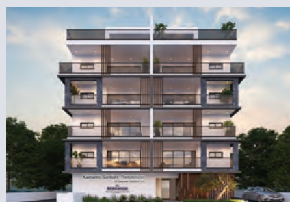
KAMARES SUNLIGHT RESIDENCES 18 Giannaki Stefanidi Str., 6041 Larnaka