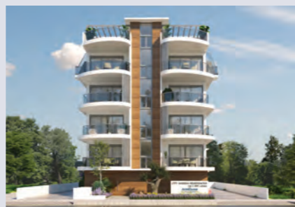
CITY MARINA RESIDENCES 4 Iras Str., 6057 Larnaca