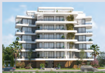
MARINA VIEW RESIDENCES 3 Agias Elenis Str., 6021 Larnaca