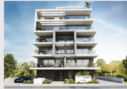
Flamingo View Residences 22 Ekalis Str., 6037, Larnaca