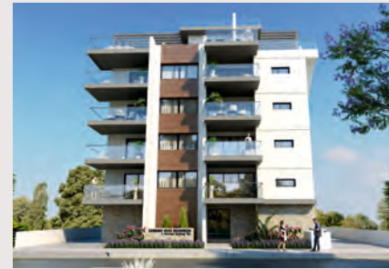
Kamares Hills Residences 4 Demetri Kallergi Str. , 6037, Larnaca.