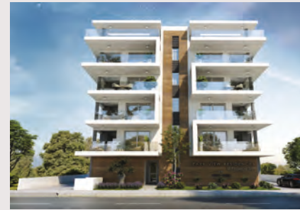
Park View Residences 9 Thiseiou Str., 6053, Larnaca.