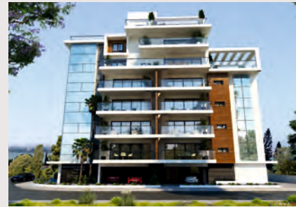
Mackenzy Beach Residences 10 Gkaite Str., 6028, Larnaca