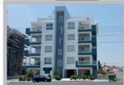
Neophytos Residences, 14 Kalymnou Str., Larnaca