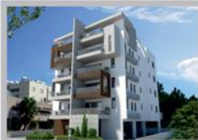
Mariam Suites, Vasileos Othonas Str., Larnaca Faneromeni, Larnaca.

PRESTIGIOUS APARTMENTS IN LARNACA - CYPRUS