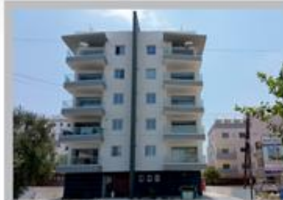
Constantinos Court, 3 Charalambos Patsides Str. (New Hospital Area), Larnaca