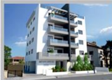
Christos Residences 10 Kalambakas Str., Larnaca